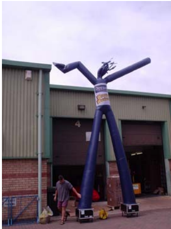
Double leg Air Dancer